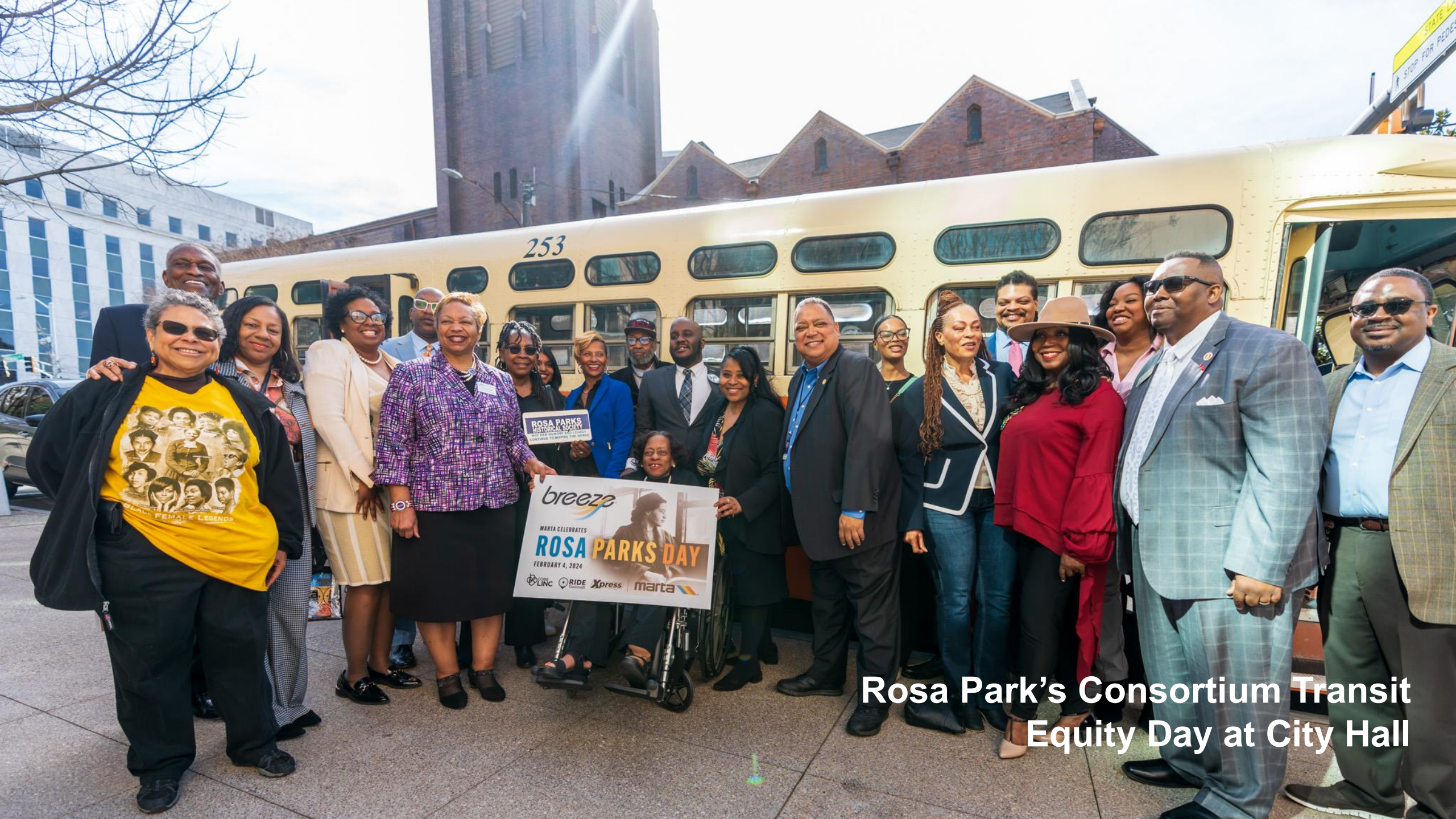
Rosa Park's Consortium Transit Equity Day at City Hall