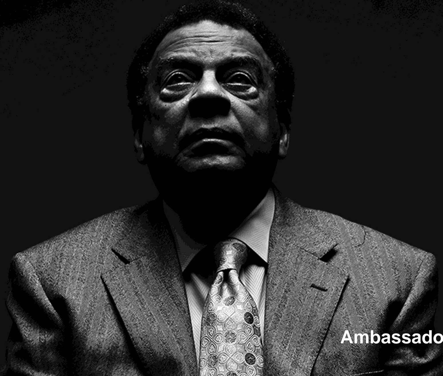
Ambassador Andrew Young