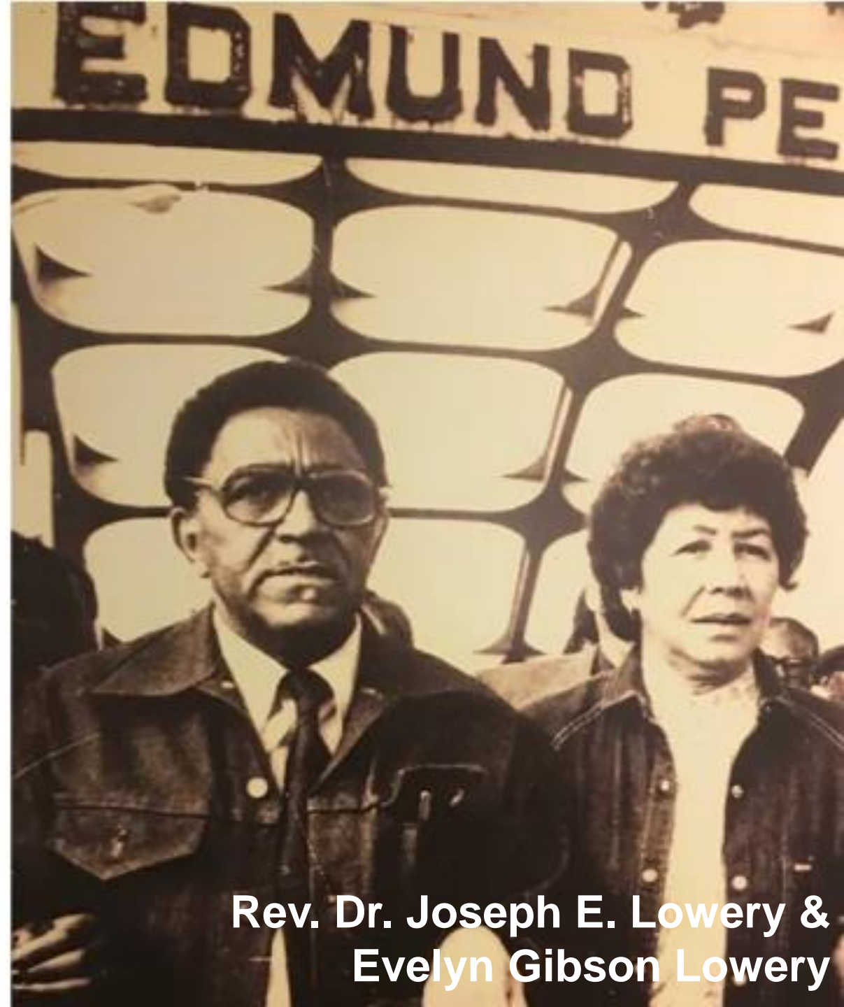
Rev. Dr. Joseph E. Lowery & Evelyn Gibson Lowery